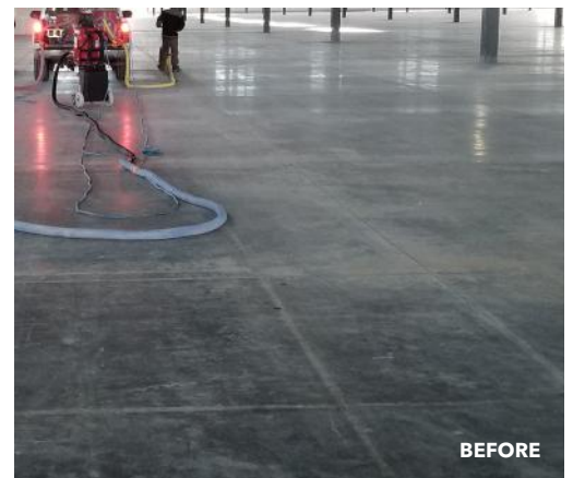
The All West Surface Prep team cuts control joints into the facility's 250,000 ft 2 of concrete floors. This photo was taken prior to any grinding or densification work.