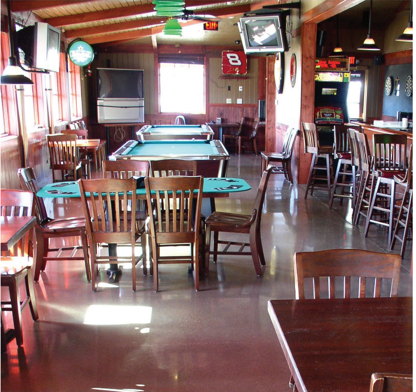
Level B, Medium Aggregate, Stained, Restaurant, 4+ Years Old