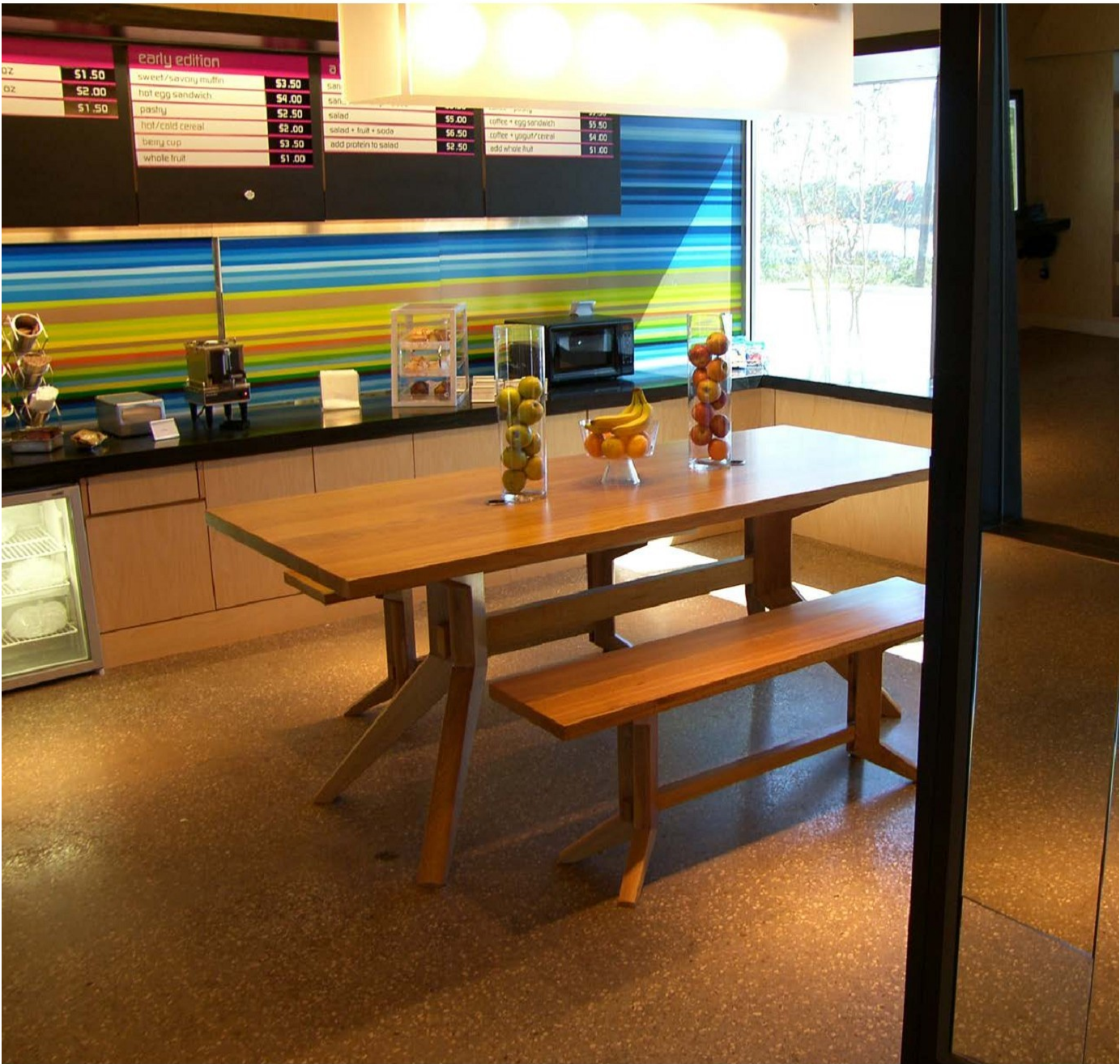
Level A, Heavy Aggregate, Colored, Hotel Lobby Restaurant