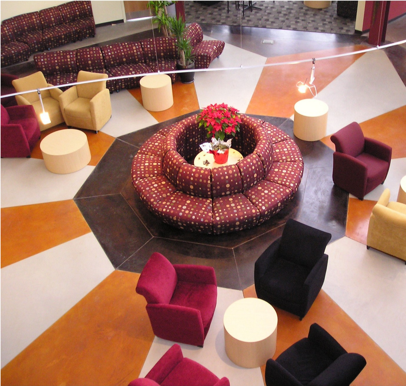
Level A, Cream, Stain, Educational