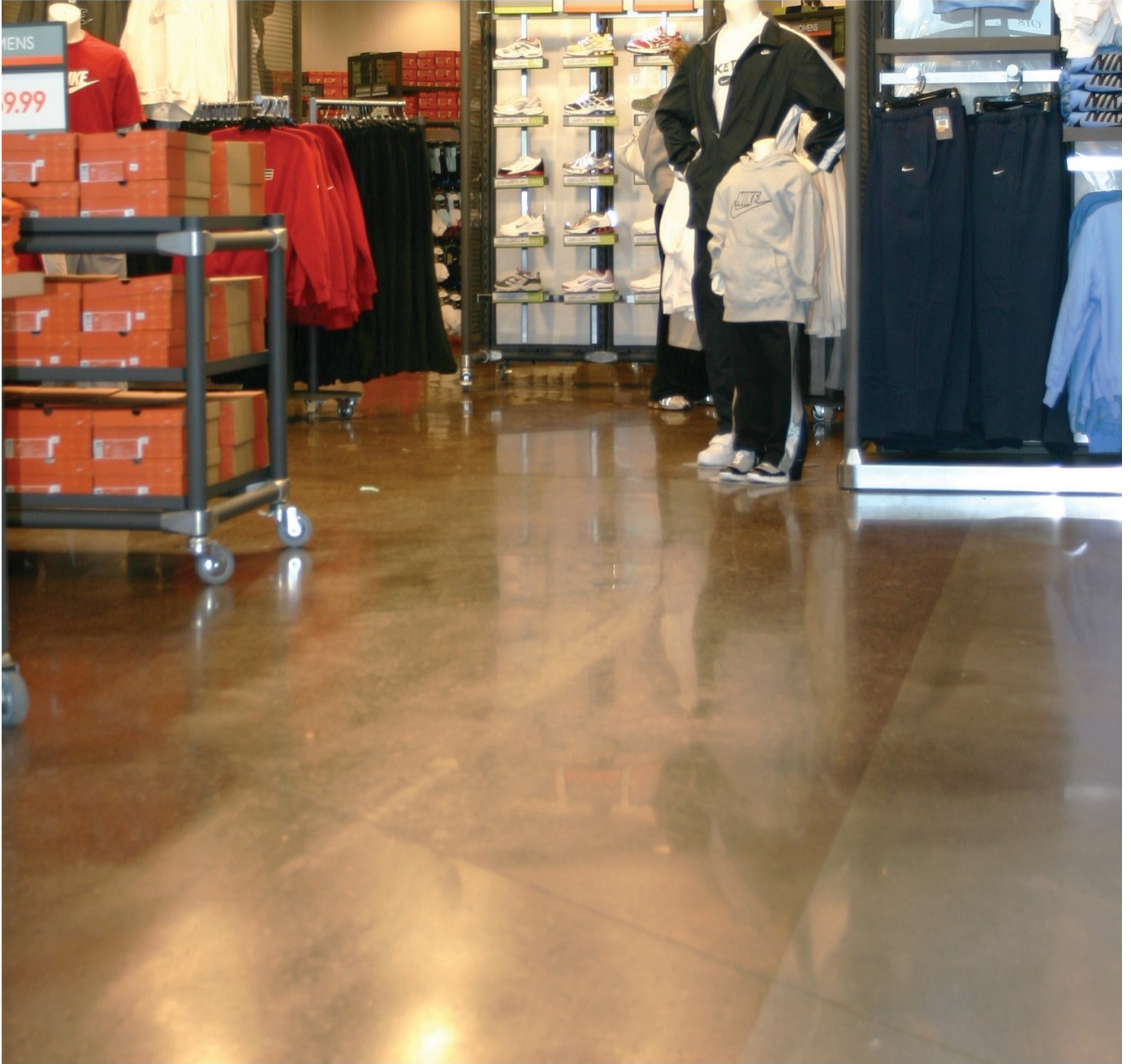
Level B, Light Aggregate, Natural Color, Retail, 6+ Years Old