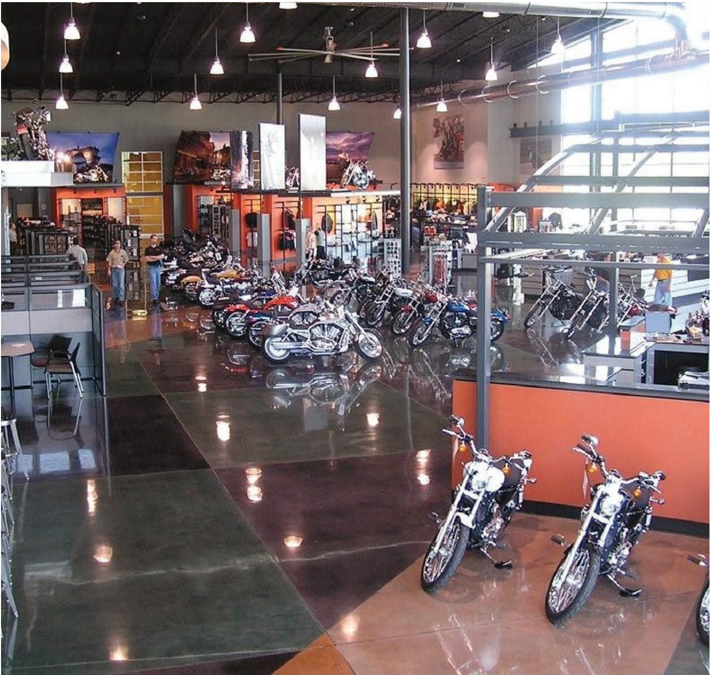
Level C, Cream, Multi-Color Stain, Retail, 4+ Years Old