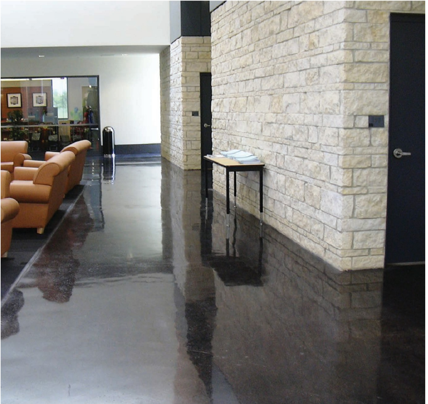
Level C, Medium to Heavy Aggregate, Black Dye, Educational