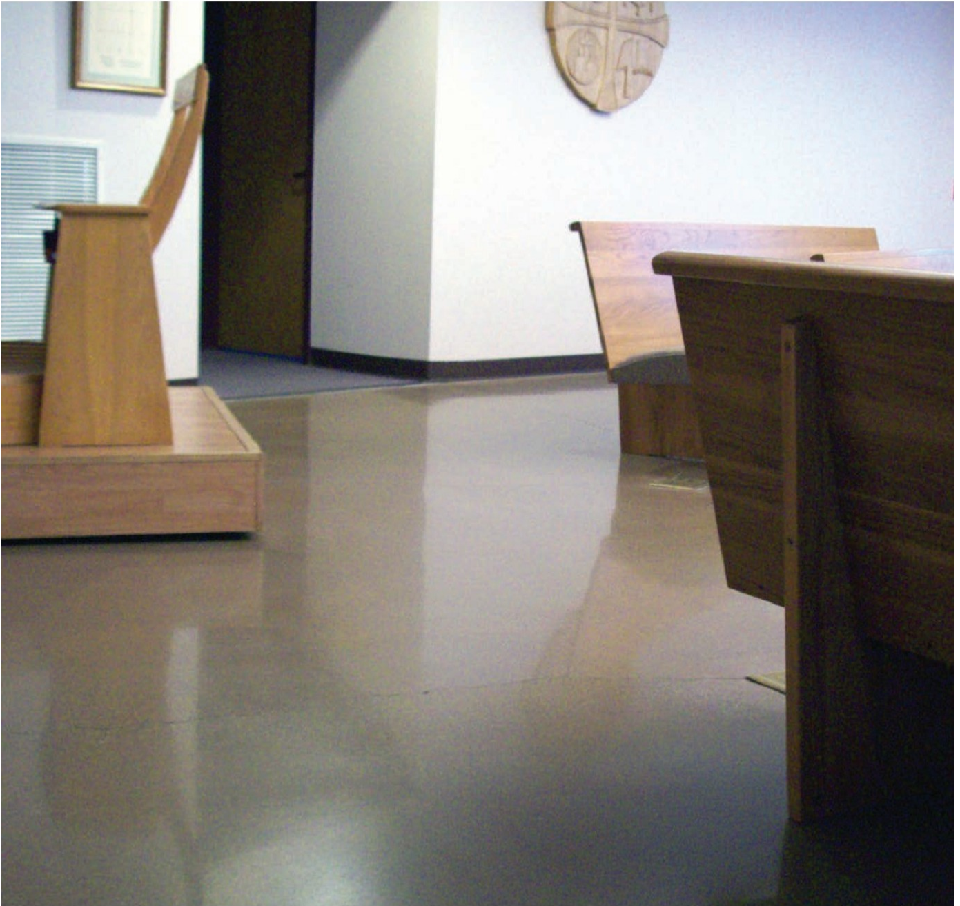
Level B, Medium Aggregate, Integral Color, Church, 8 Years Old