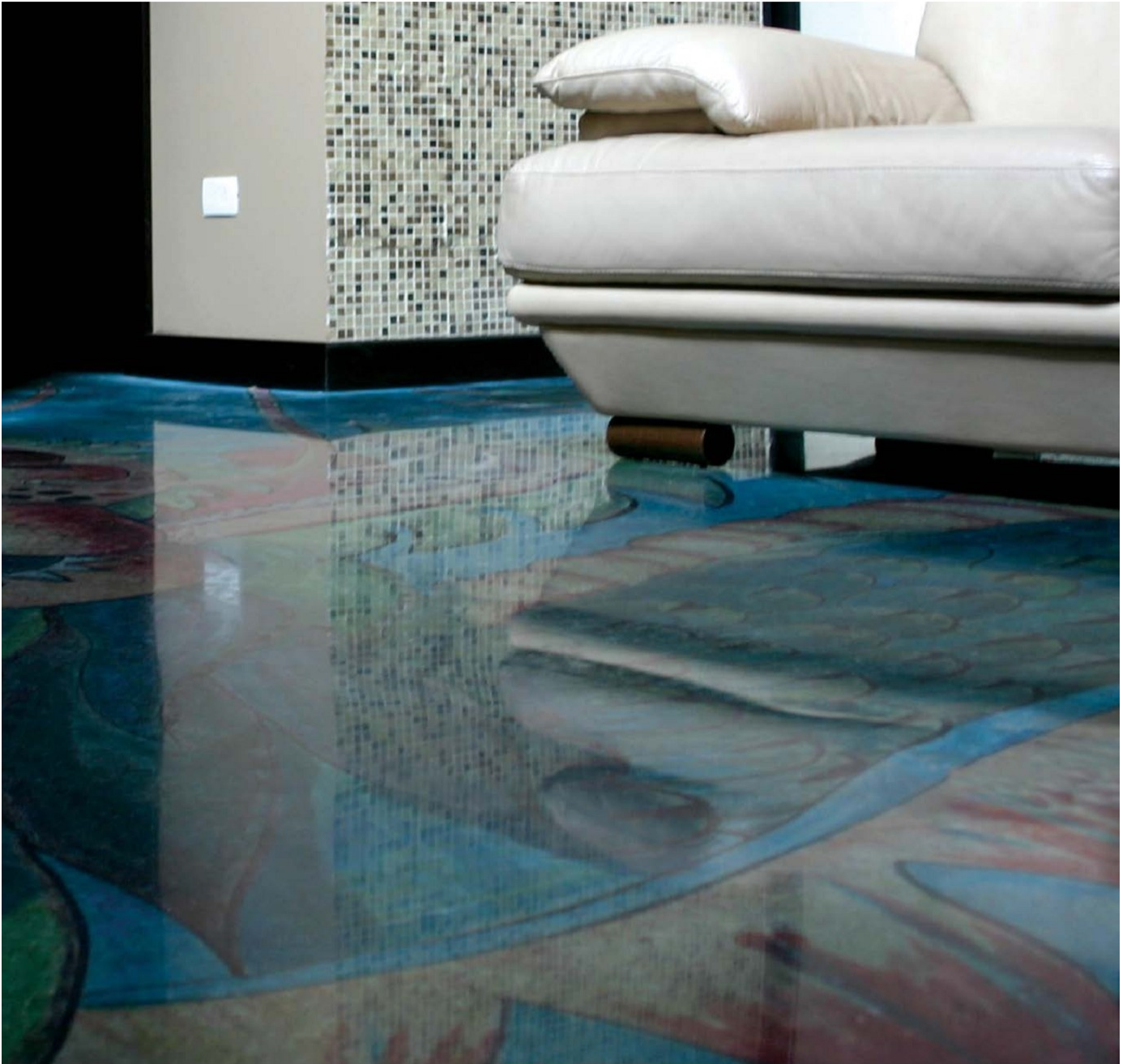
Level C, Cream, Multi-Color Stain, Restaurant, 4+ Years Old