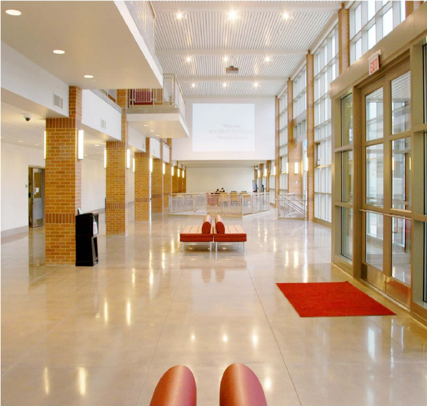
Level B, Medium Aggregate, Natural Color, Educational