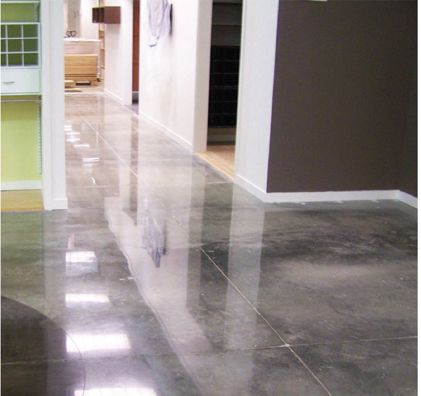
Level C, Medium to Heavy Aggregate, Natural & Stain, Office