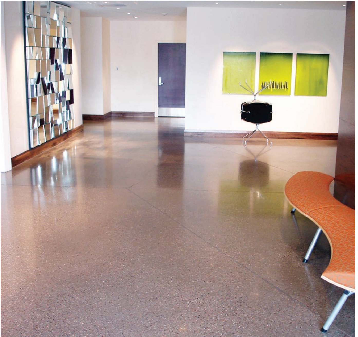
Level B, Heavy Aggregate, Integral Color, Hotel