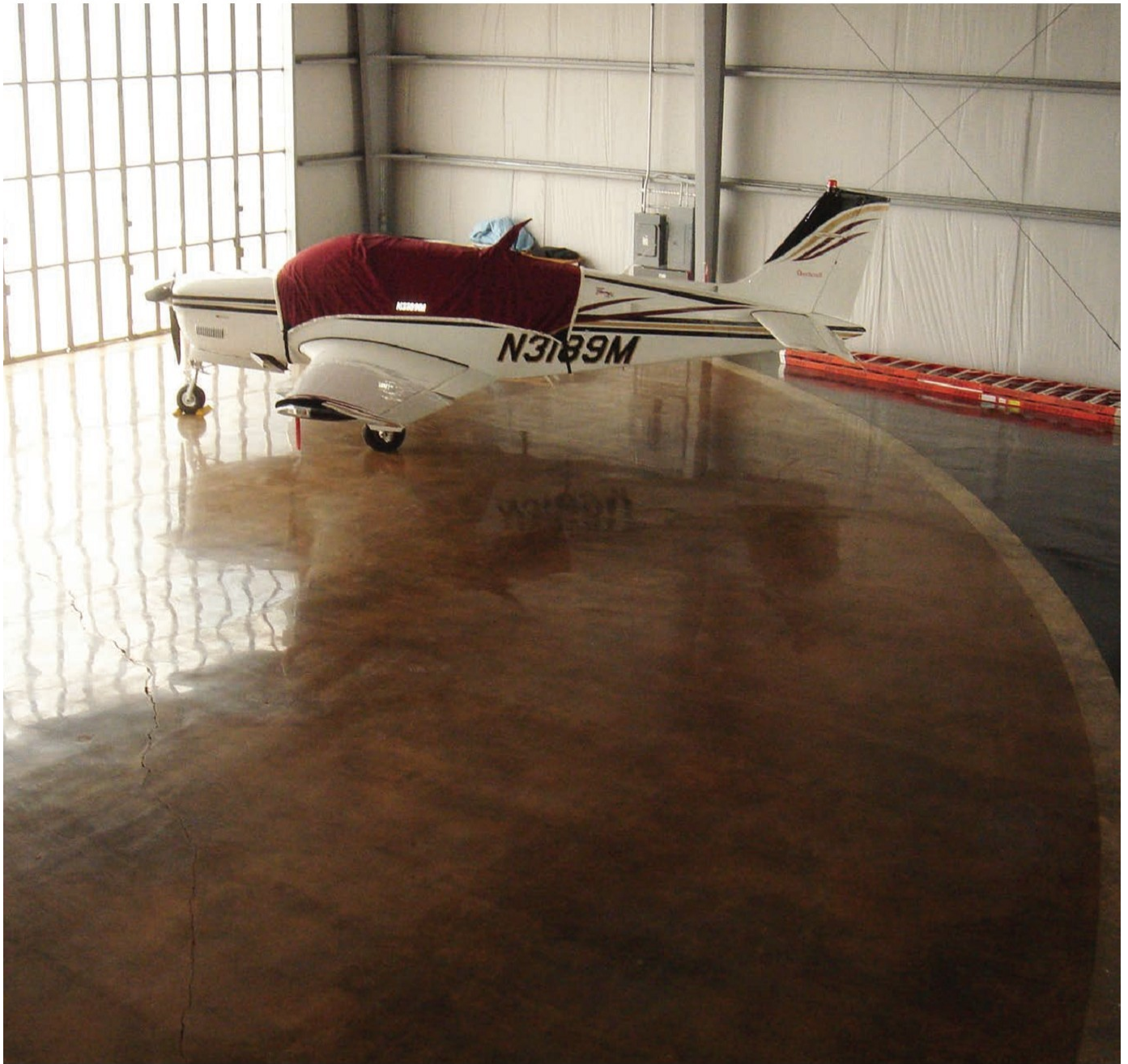
Level C, Heavy Aggregate, Dye, Airplane Hangar, 5+ Years Old