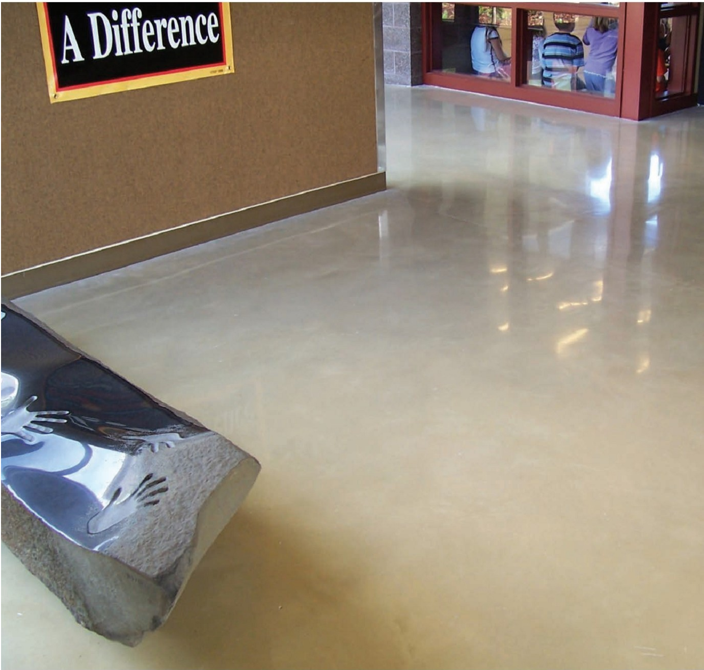
Level B, Salt & Pepper Aggregate, Dry Shake-On Hardener, Natural Color, Educational, 6+ Years Old