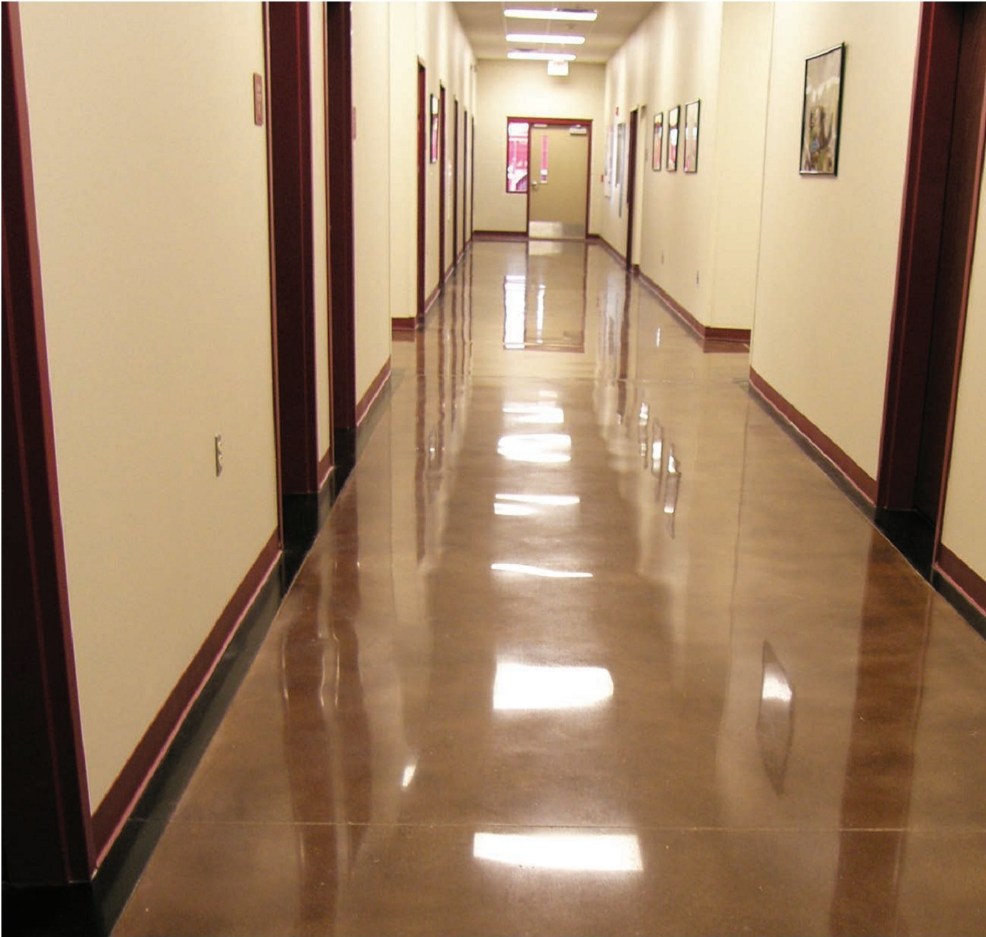
Level C, Light Aggregate, Stain, Office