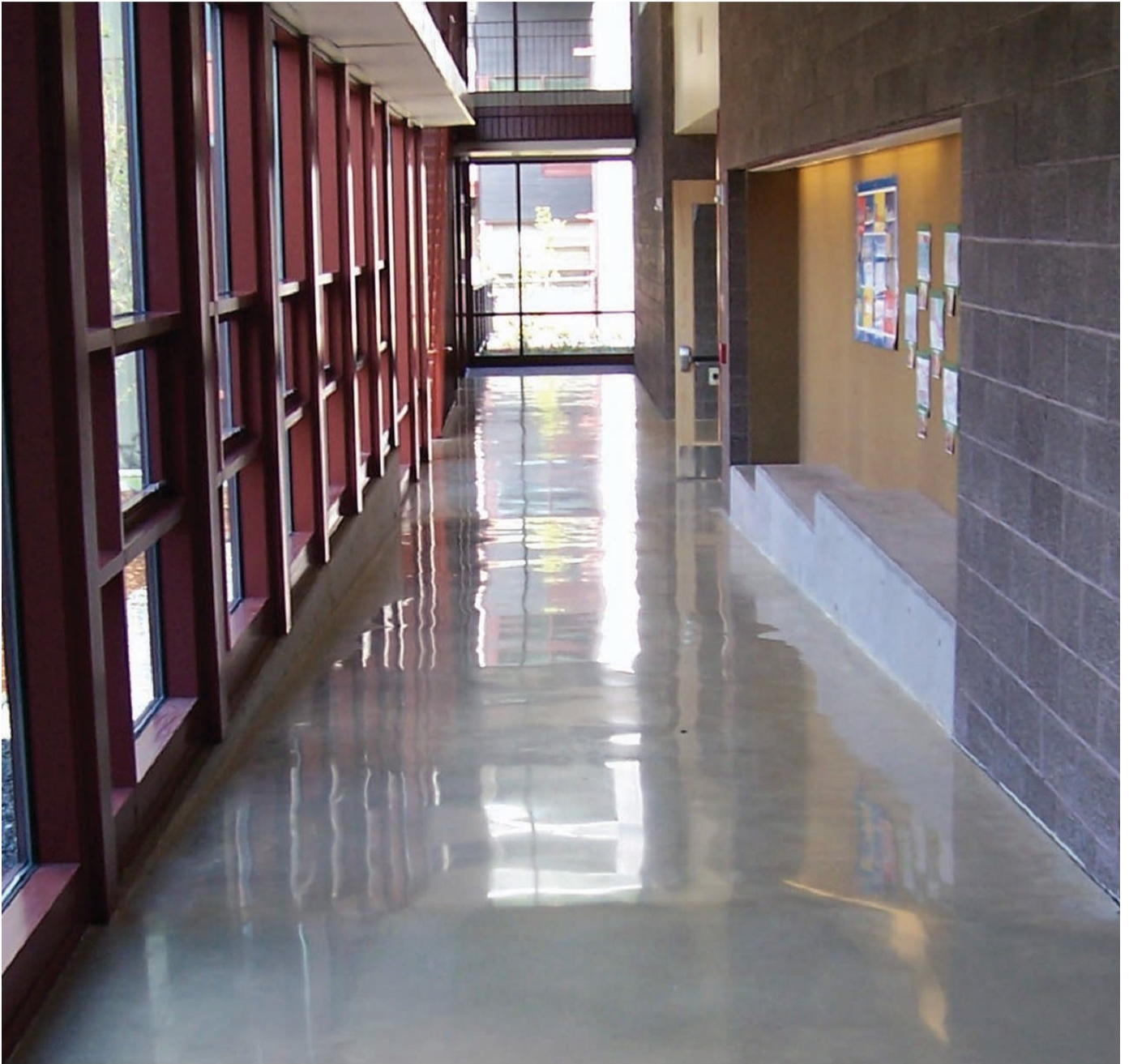
Level B, Cream, Dry Shake-On Hardener, Natural Color, Educational, 7 Years Old