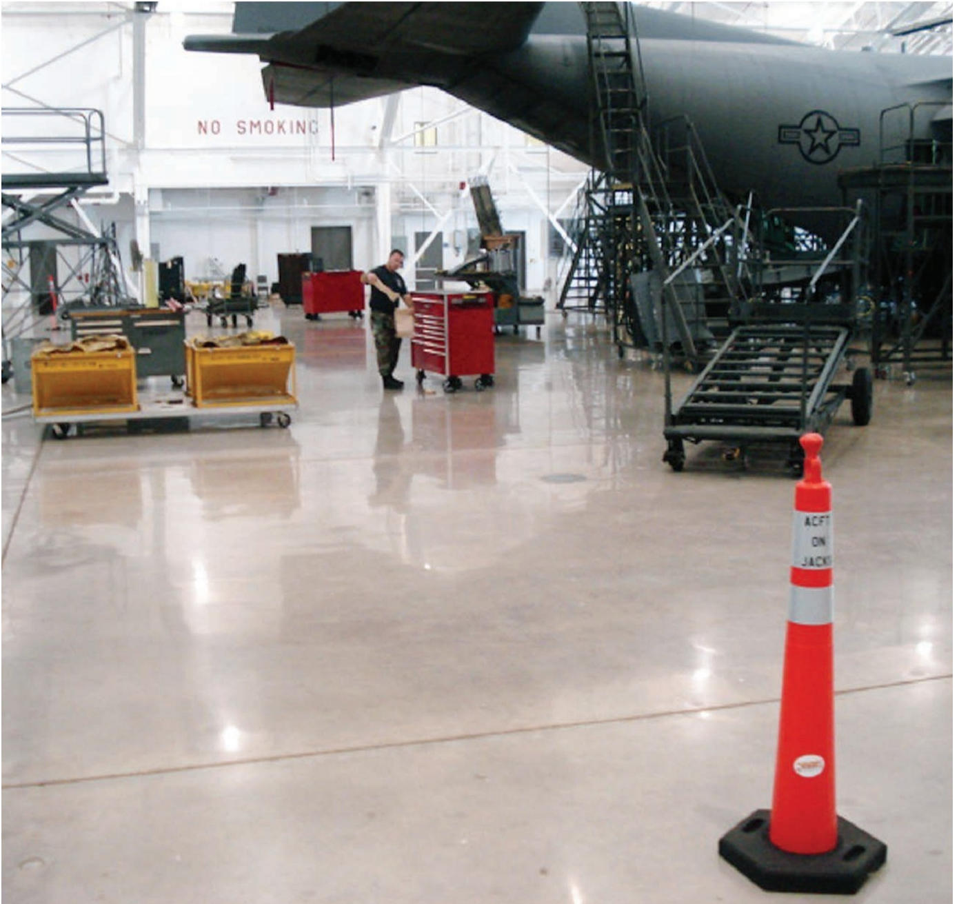
Level B, Cream, Natural, Aviation Repair Shop, 4+ Years Old