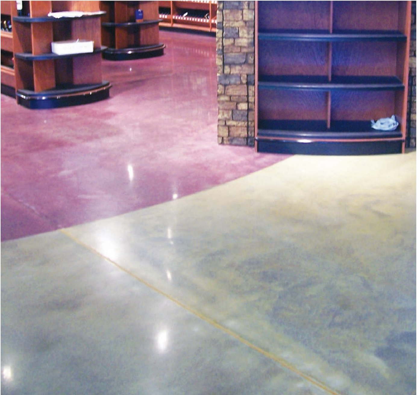
Level B, Cream, Stain, 2 Tone, Grocery