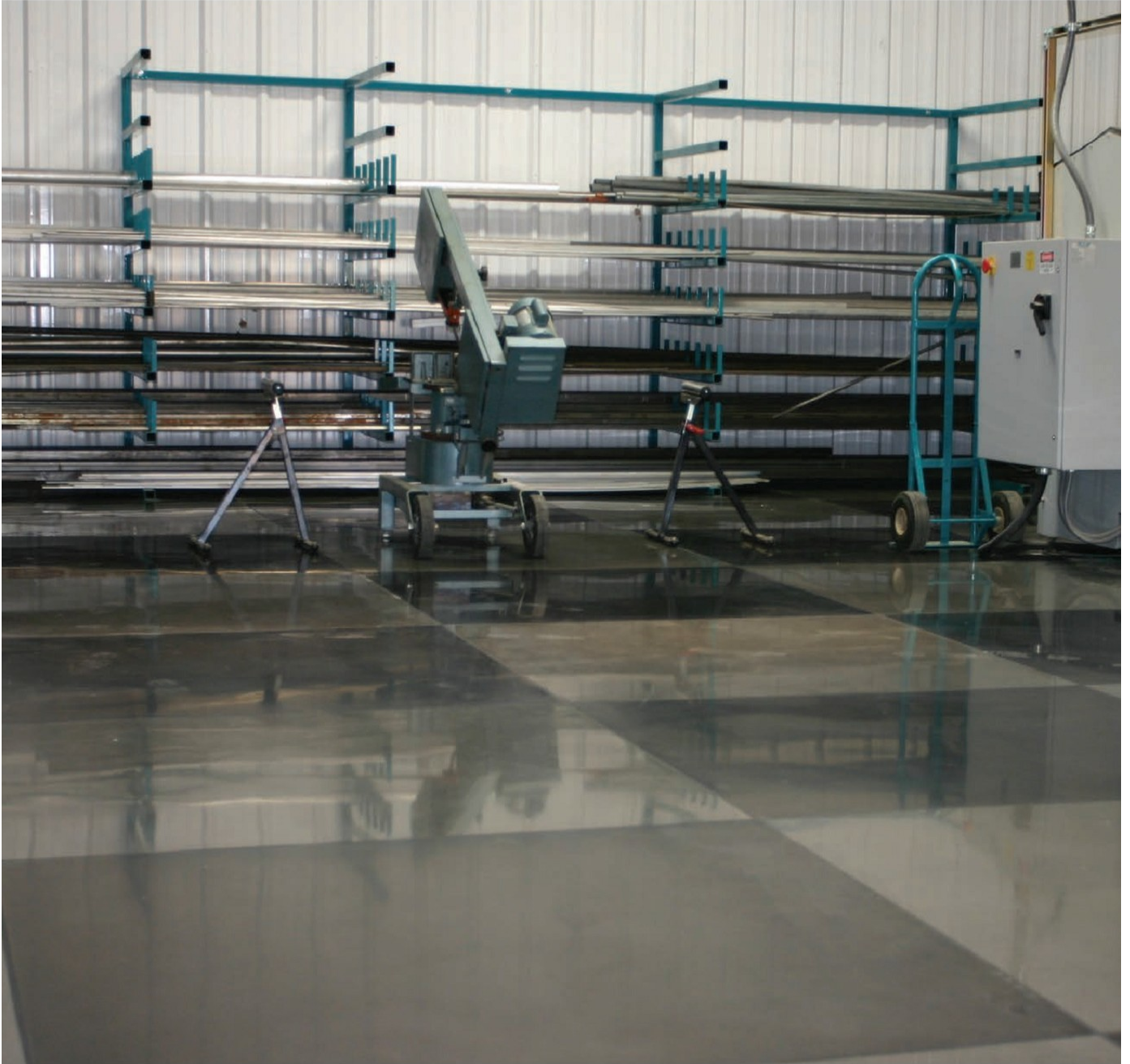
Level C, Cream, 2 Tone Stain Color, Manufacturing, 3+ Years Old