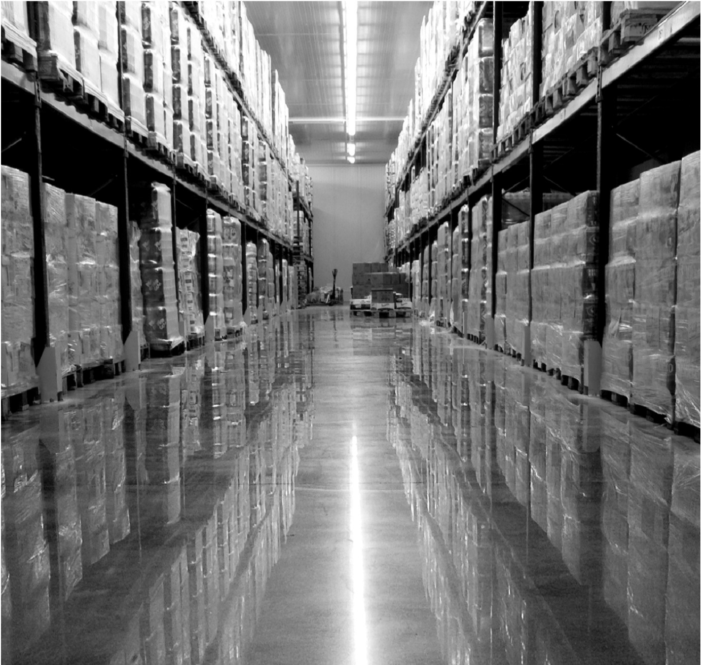
Level C, Cream, Natural Color, Warehouse