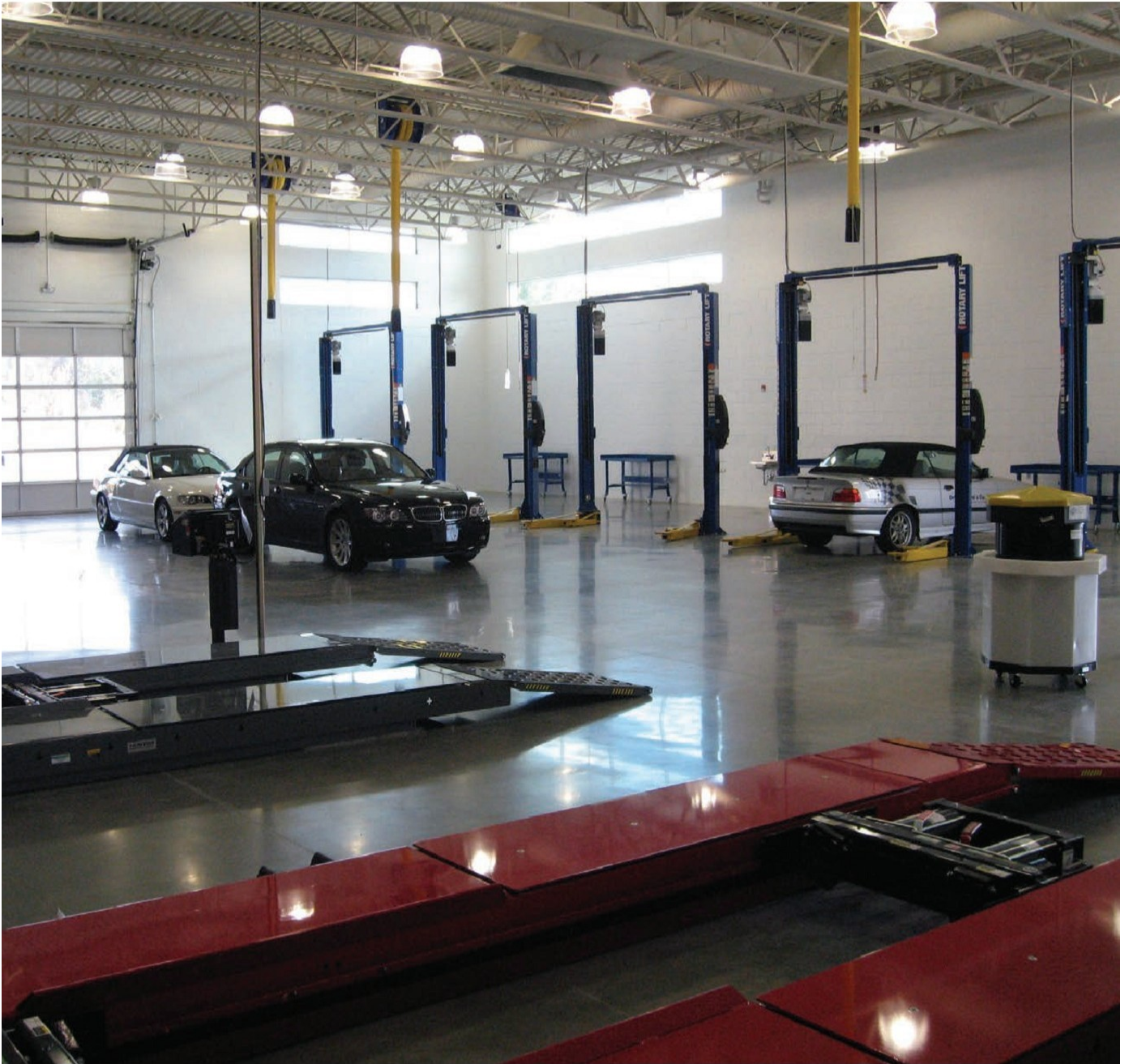
Level B, Cream, Natural Color, Auto Repair, 3 Years Old