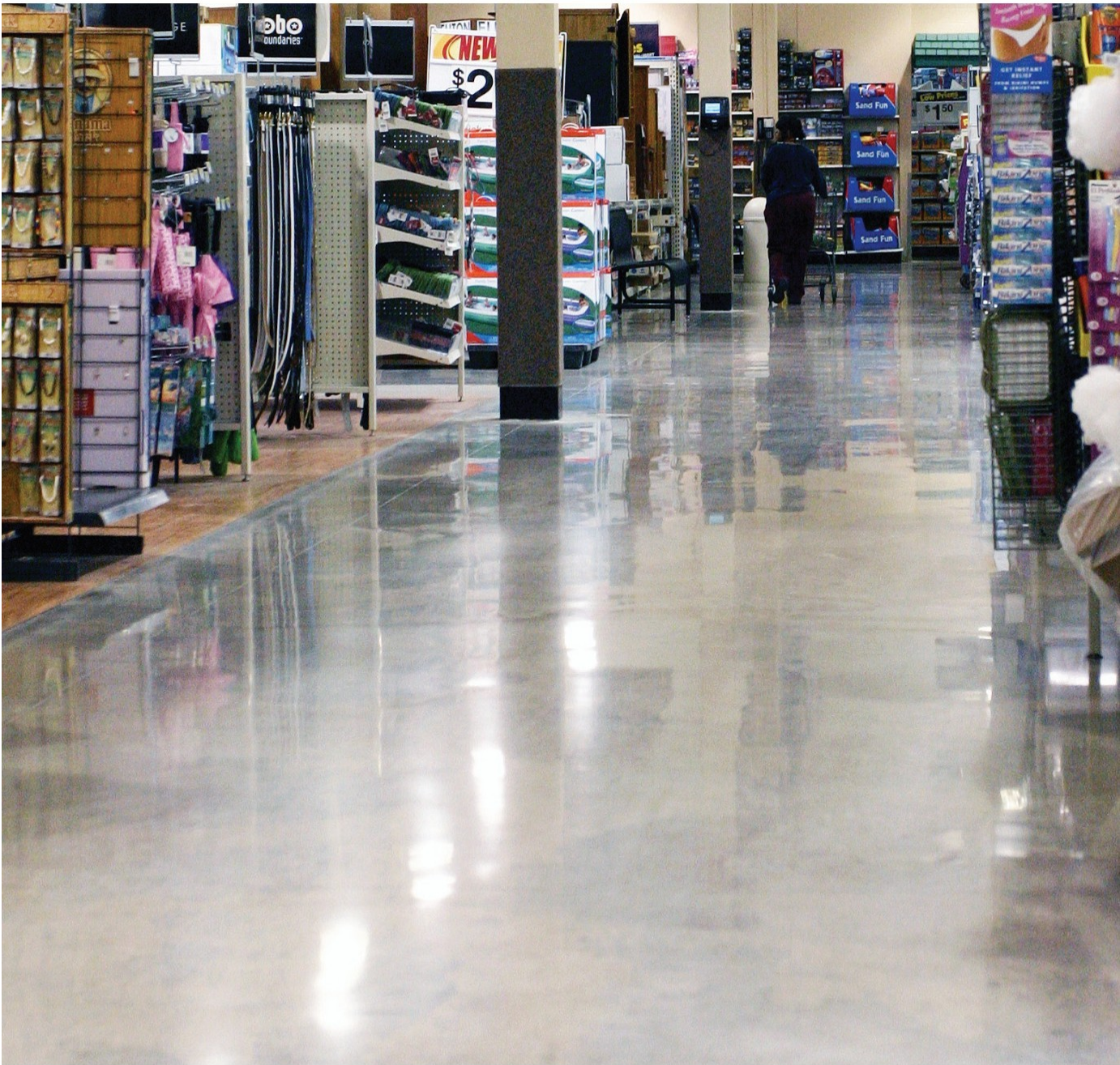
Level B, Cream, Natural Color, Retail, 3 Years Old