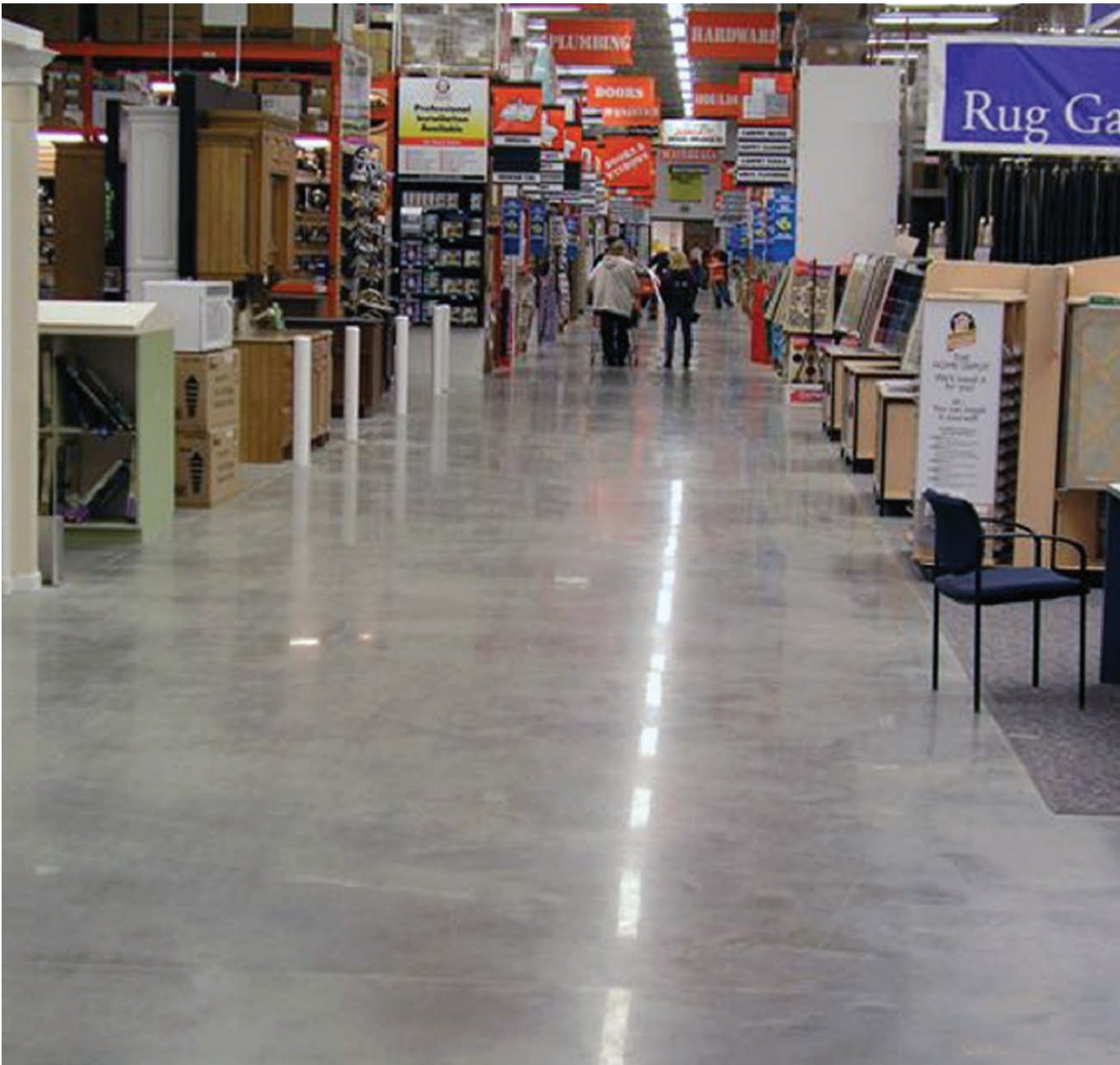
Level B, Cream, Natural Color, Retail, 7+ Years Old