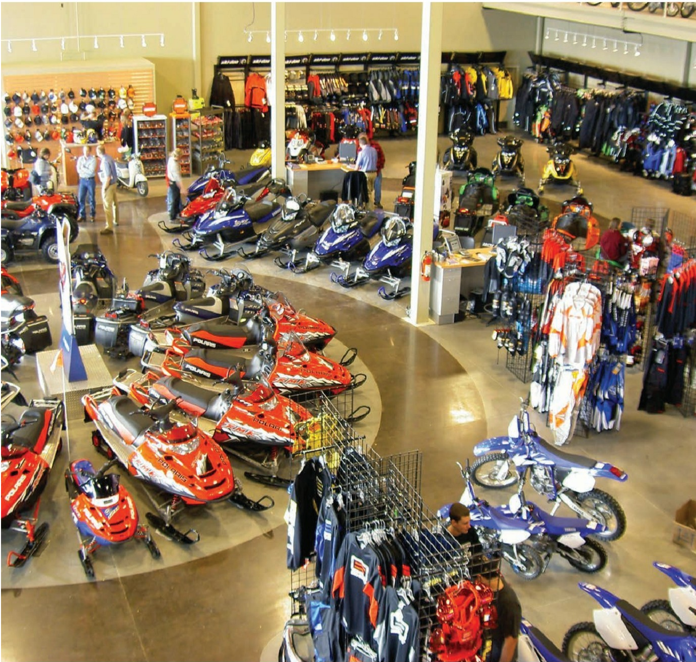
Level B, Cream, 2 Tone Stain, Retail