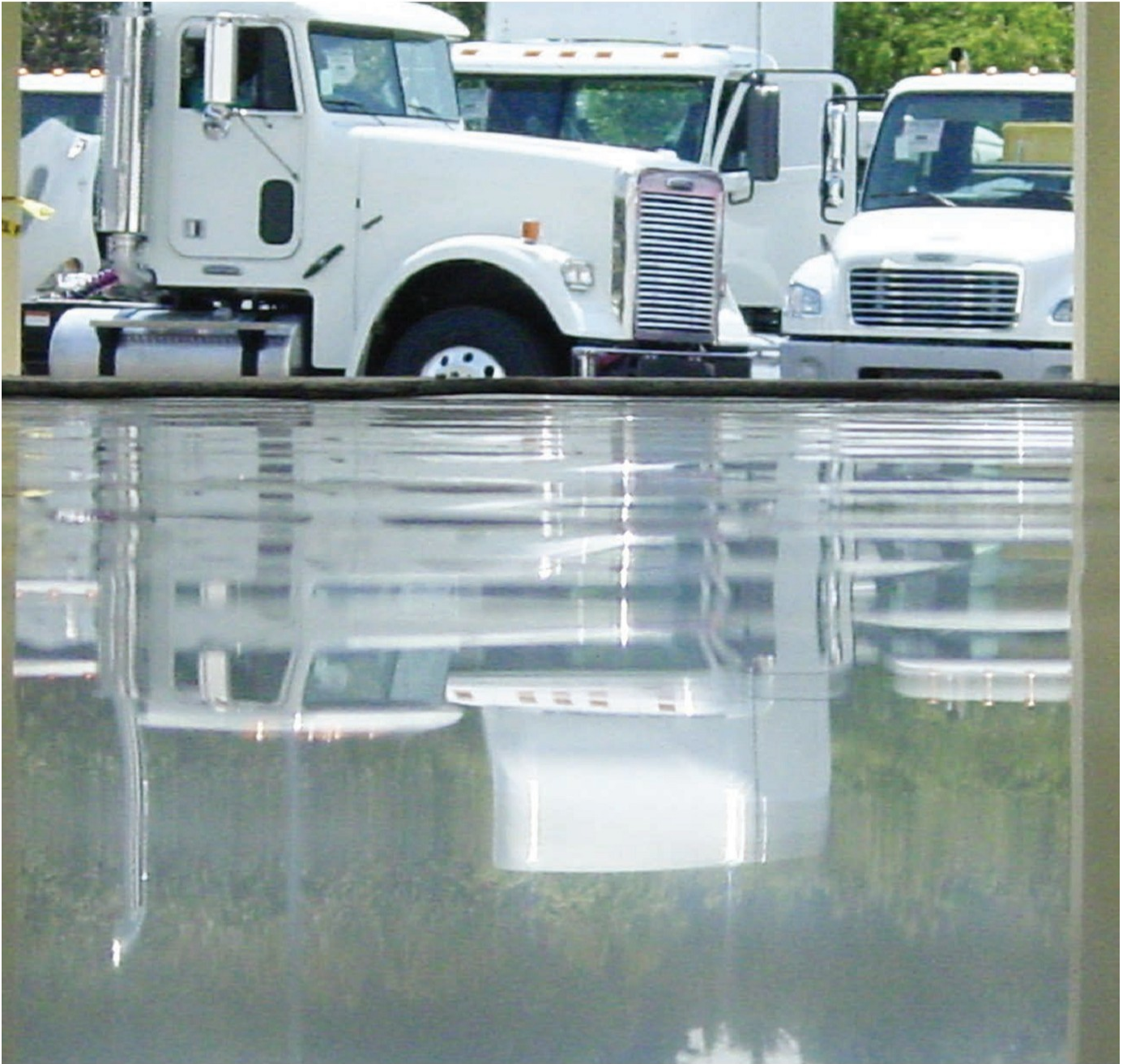
Level C, Cream, Stain, Warehouse, 4 Years Old