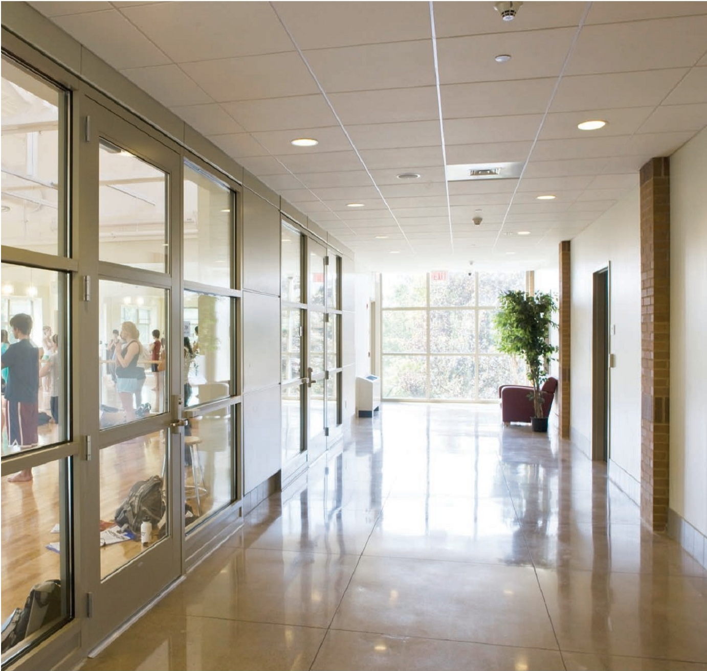
Level B, Medium Aggregate, Natural Color, Educational