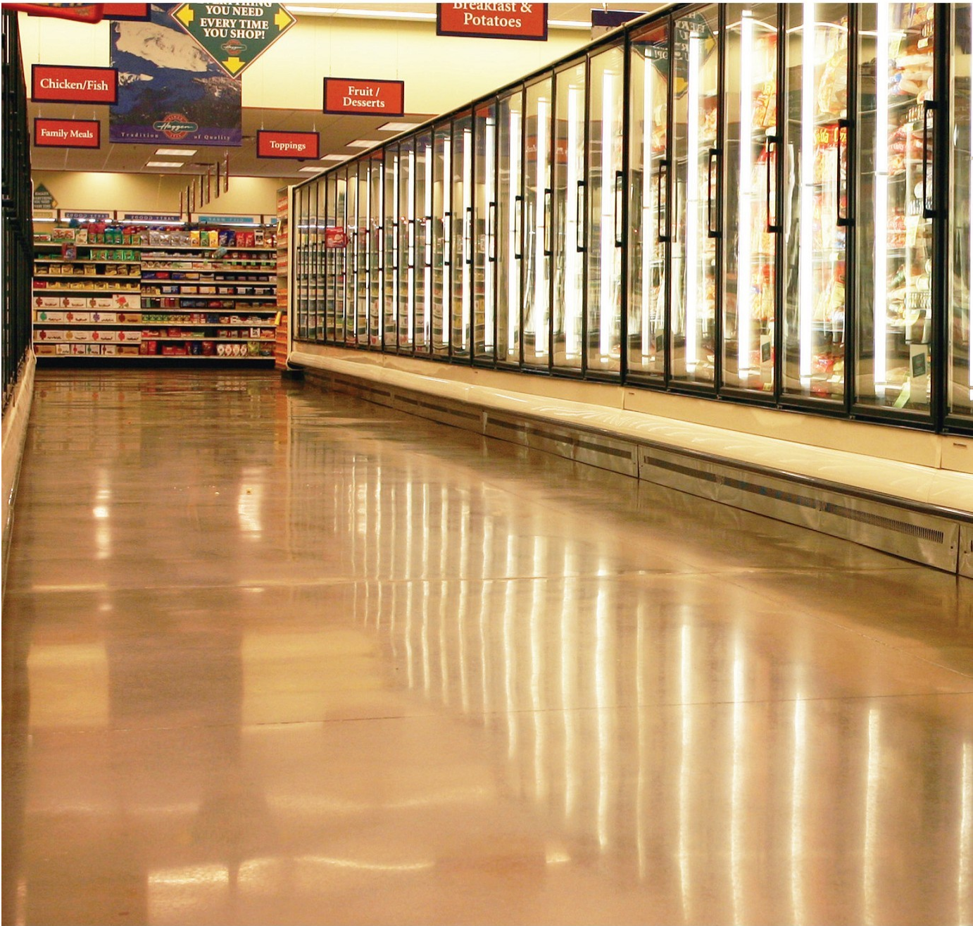
Level B, Cream, Colored, Acid Stain, Grocery, 6+ Years Old