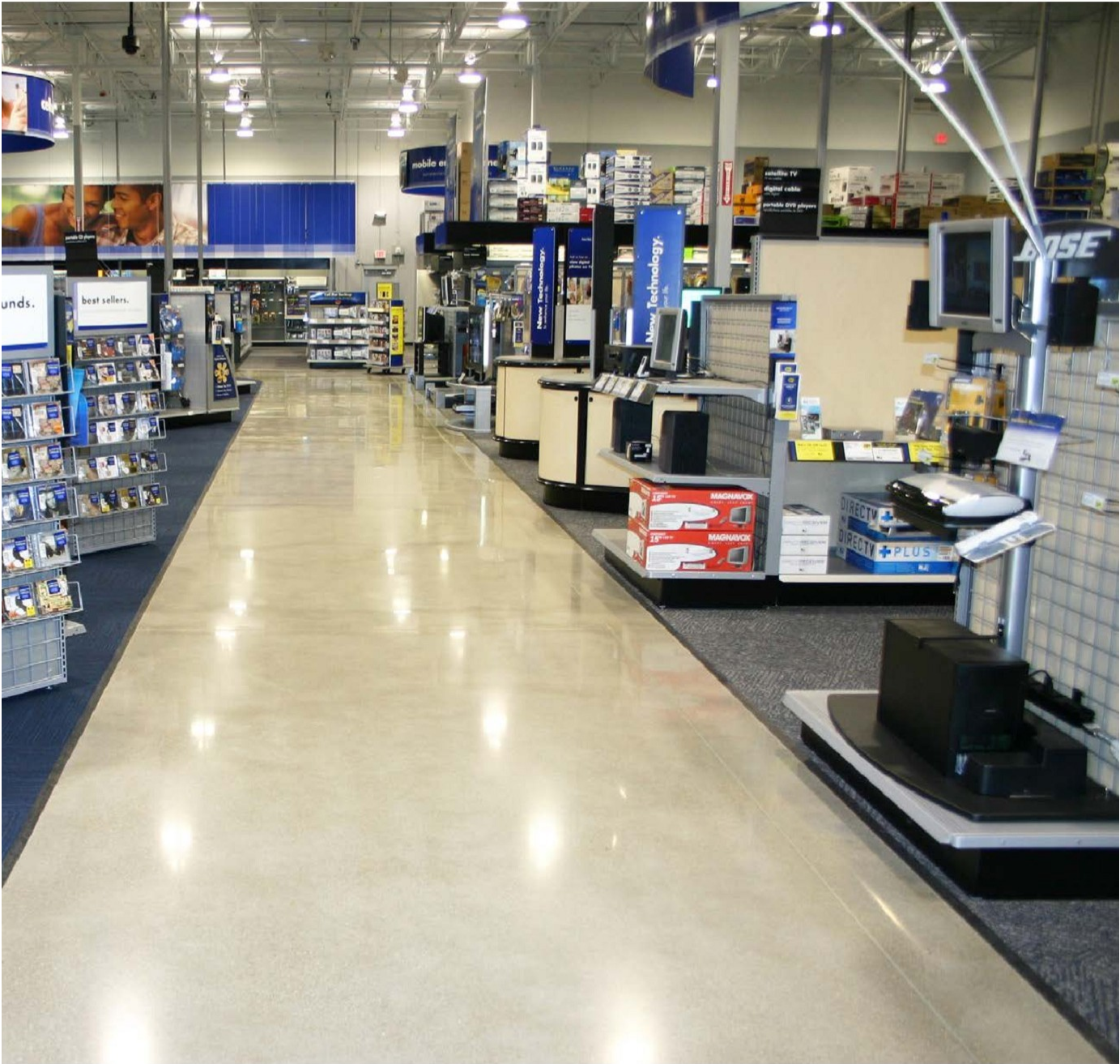
Level B, Salt & Pepper Aggregate, Natural Color, Retail, 3+ Years