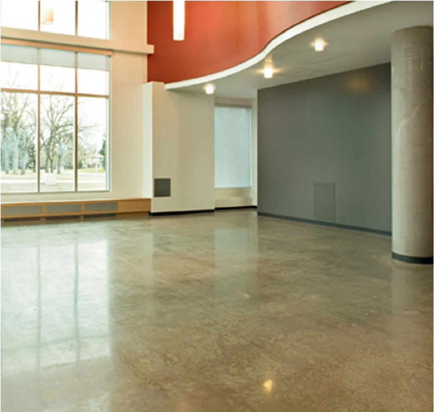
Level B, Cream, Gray Color, Hospital, 3 Years Old