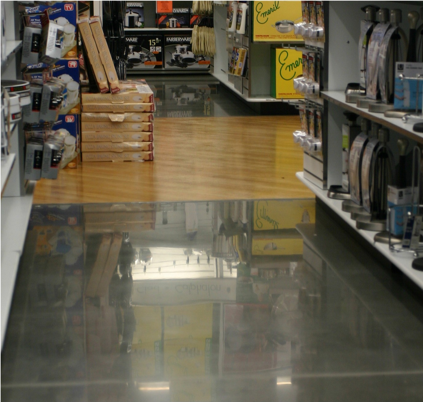
Level C, Cream, Natural Color, Retail, 6+ Years Old