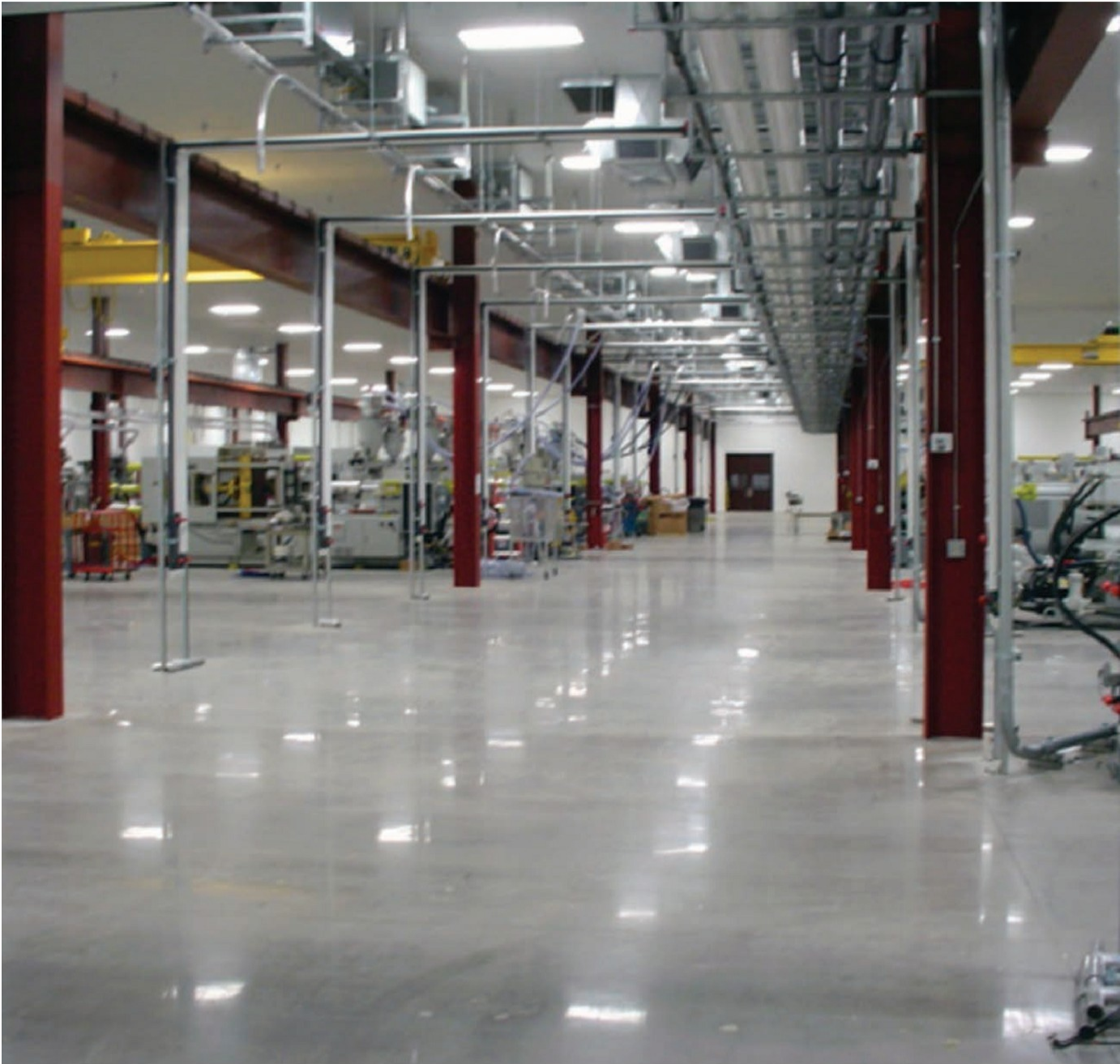
Level B, Cream, Natural Color, Manufacturing