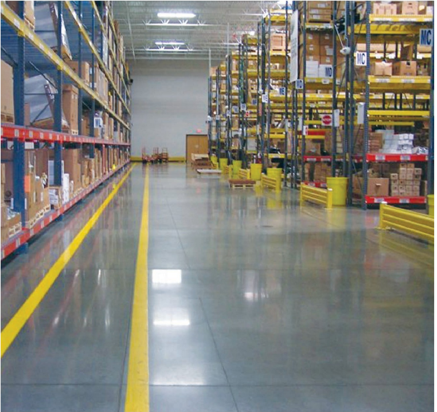
Level B, Cream, Natural Color, Parts Warehouse, 6 Years Old