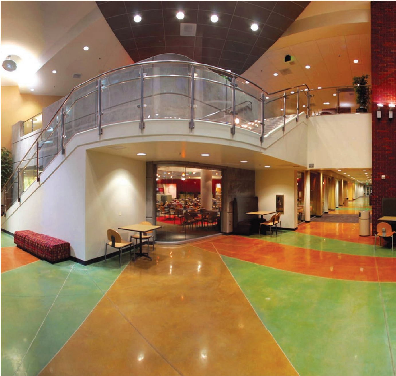
Level B, Cream, Stain, Multi-Color, Educational, 2 Years Old