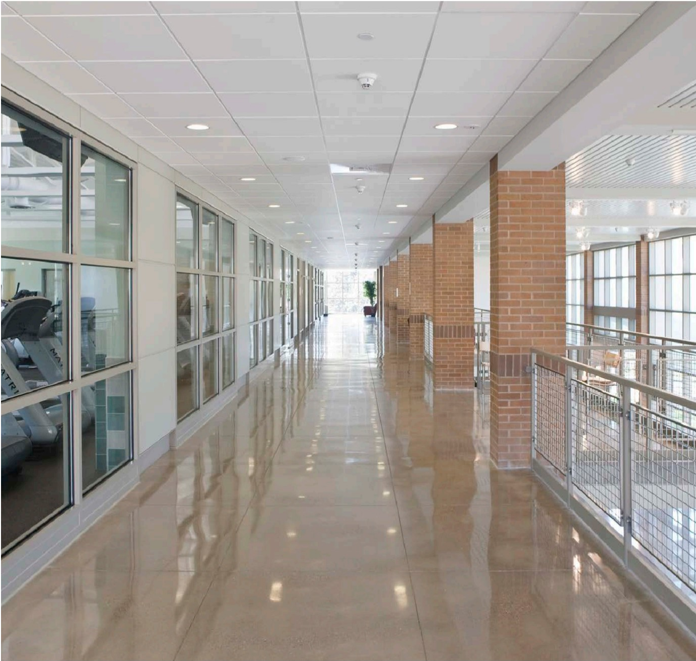
Level B, Medium Aggregate, Natural Color, Educational