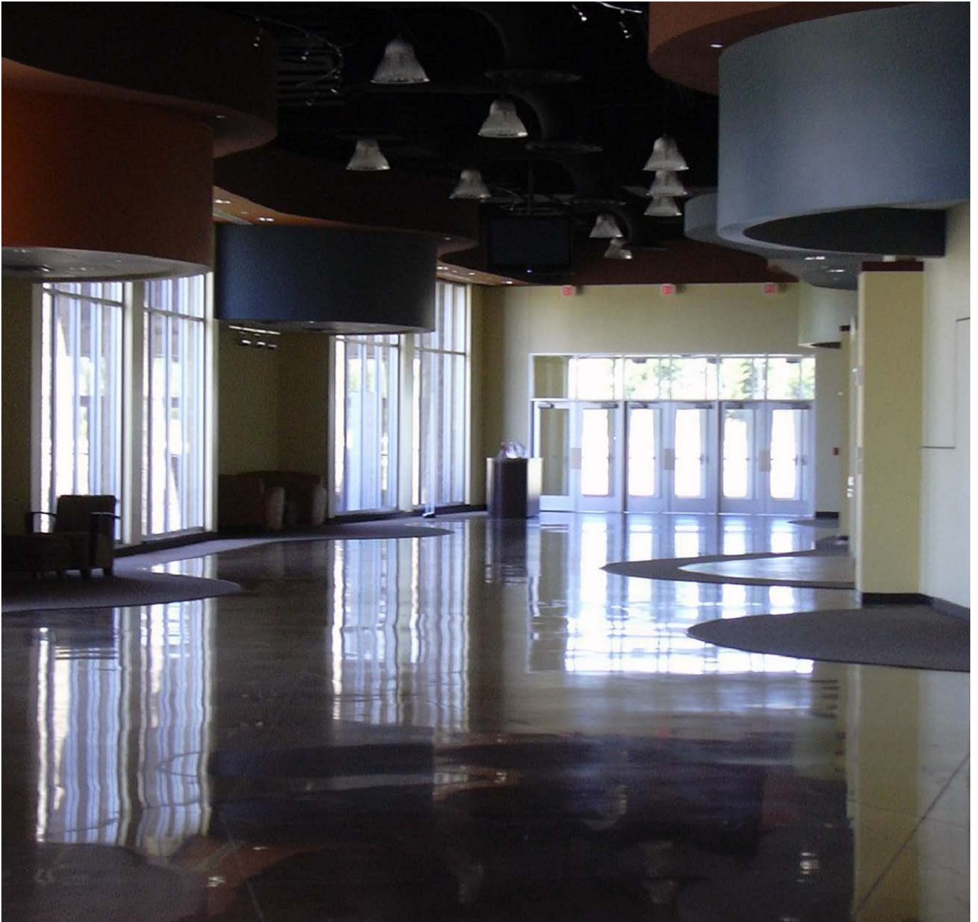
Level B, Cream, Chocolate Brown & Burnt Sienna Dye, Church