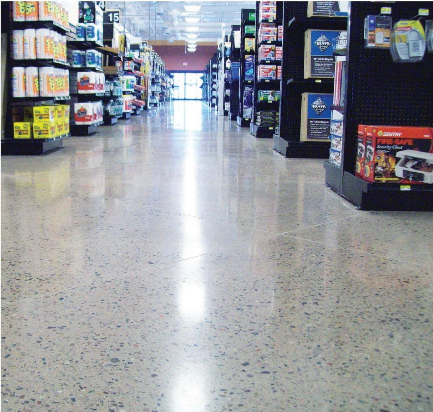
Level B, Heavy Aggregate, Natural Color, Hardware Store, 3 Years Old