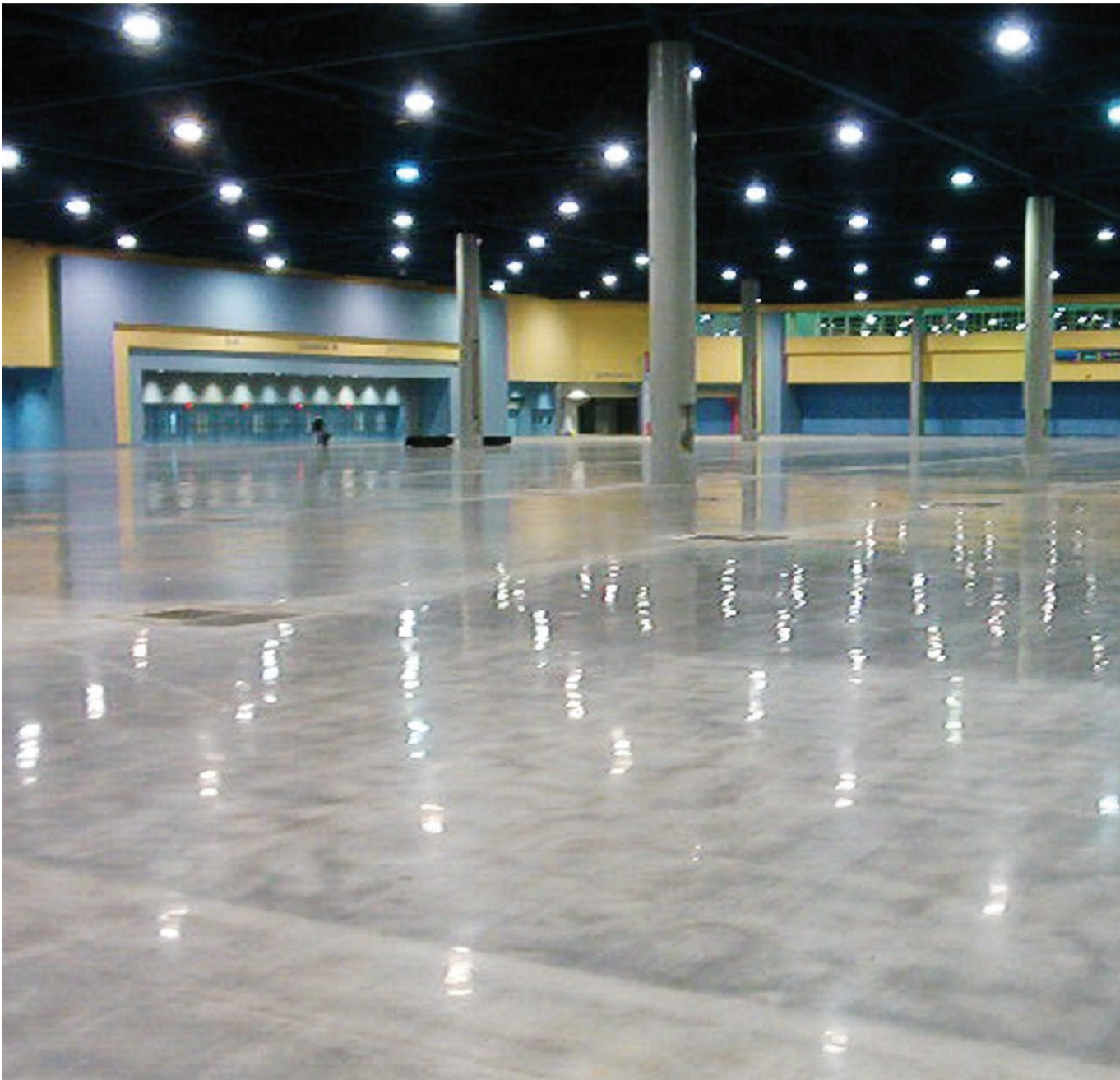
Level B, Cream, Natural Color, Convention Center