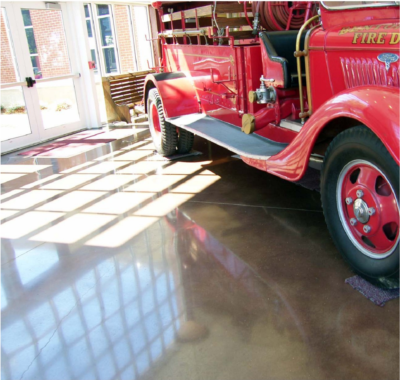
Level B, Medium Aggregate, Natural Color, Fire Station