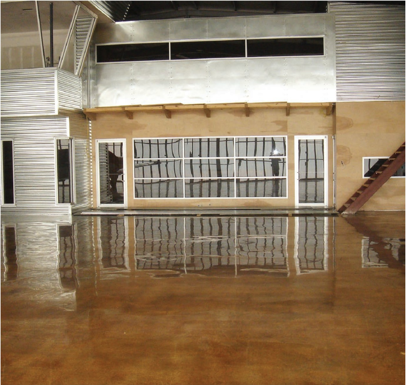
Level C, Heavy Aggregate, Dye, Airplane Hangar, 5+ Years Old