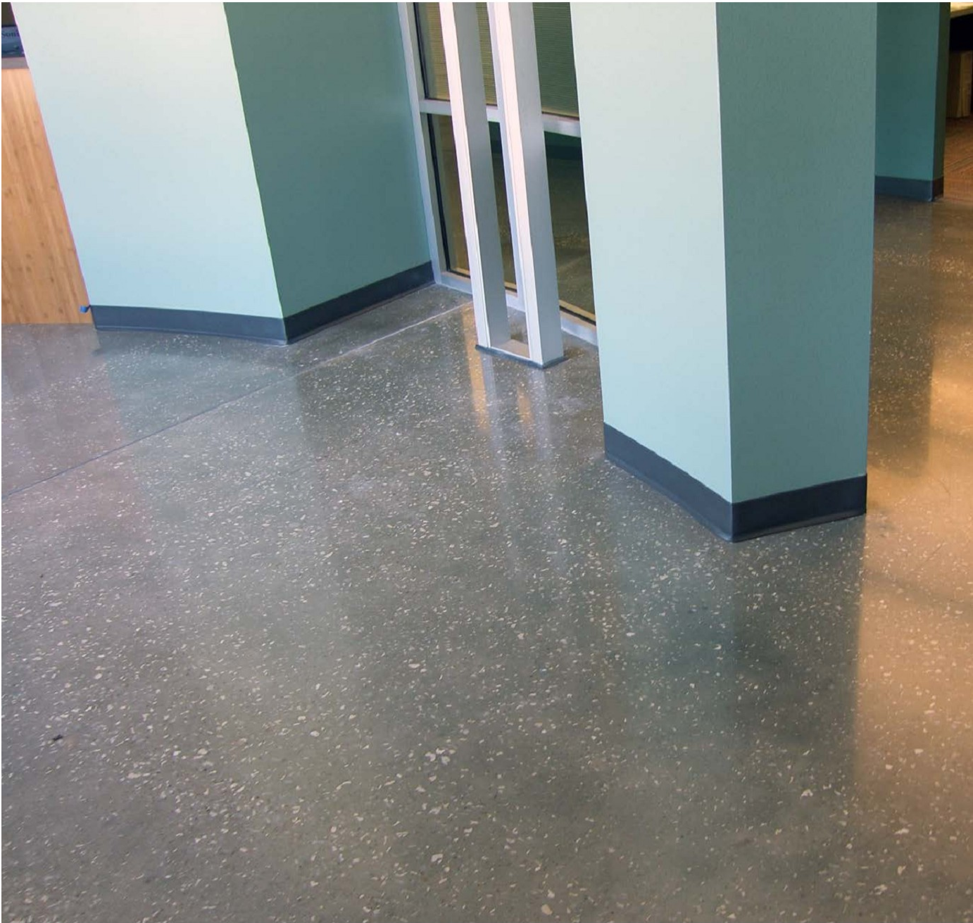
Level A, Heavy Aggregate, Colored, Office