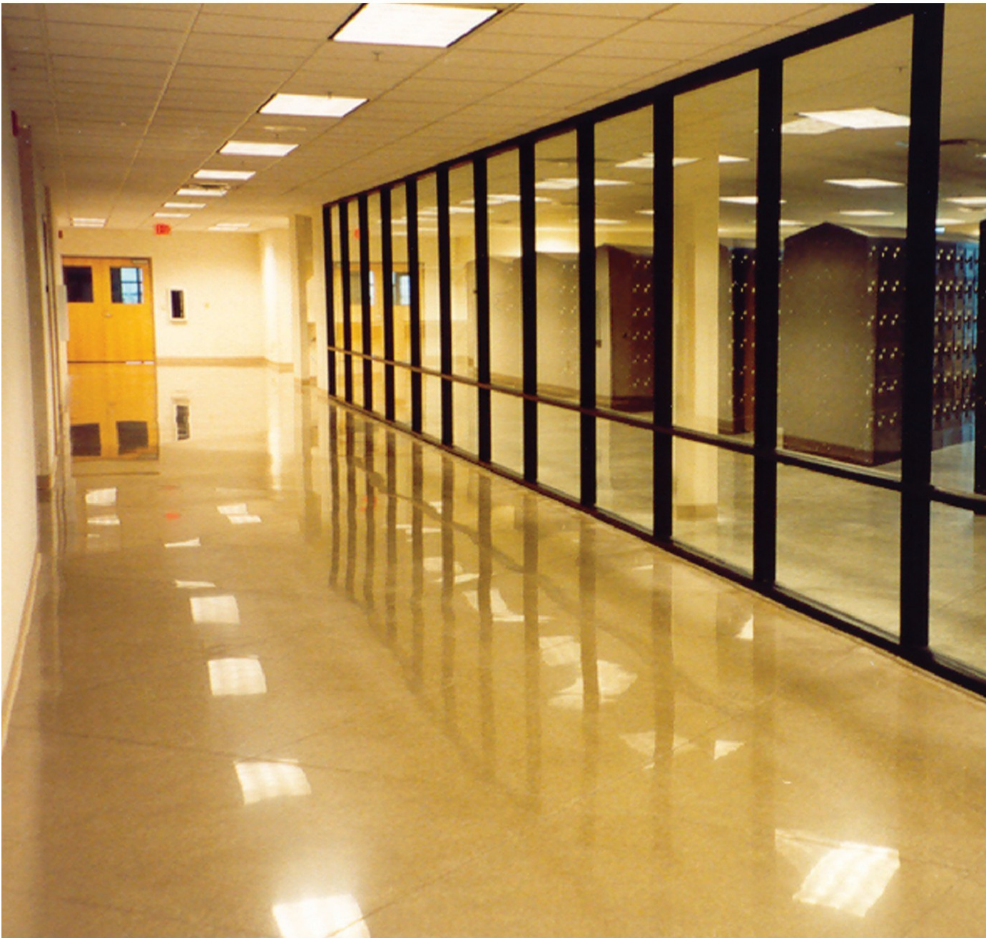
Level B, Medium Aggregate, Natural Color, Office, 9+ Years Old