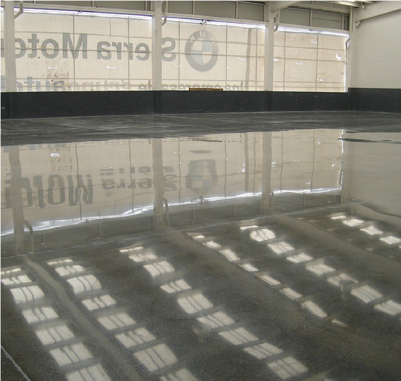
Level C, Light Aggregate, Colored, Manufacturing, 3+ Years Old