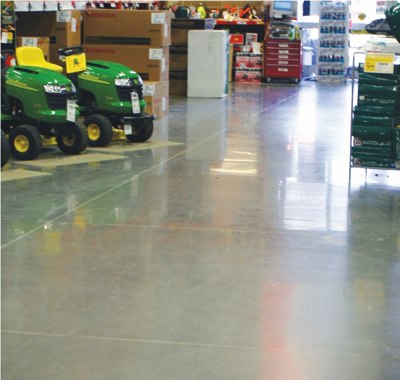
Level B, Cream, Natural Color, Retail, 5 Years Old