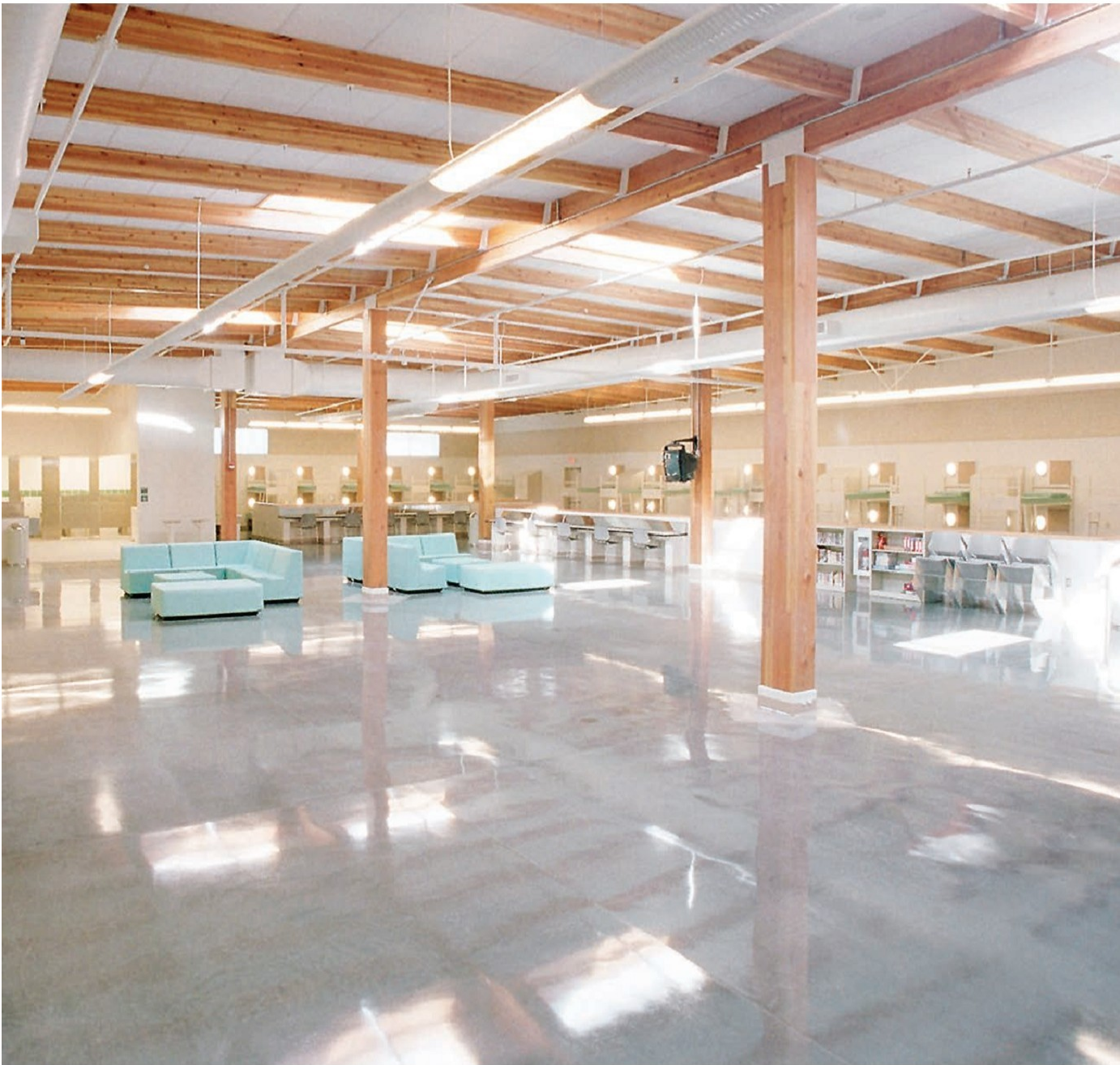
Level B, Light Aggregate, Natural Color, Correctional Facility, 5+Years Old