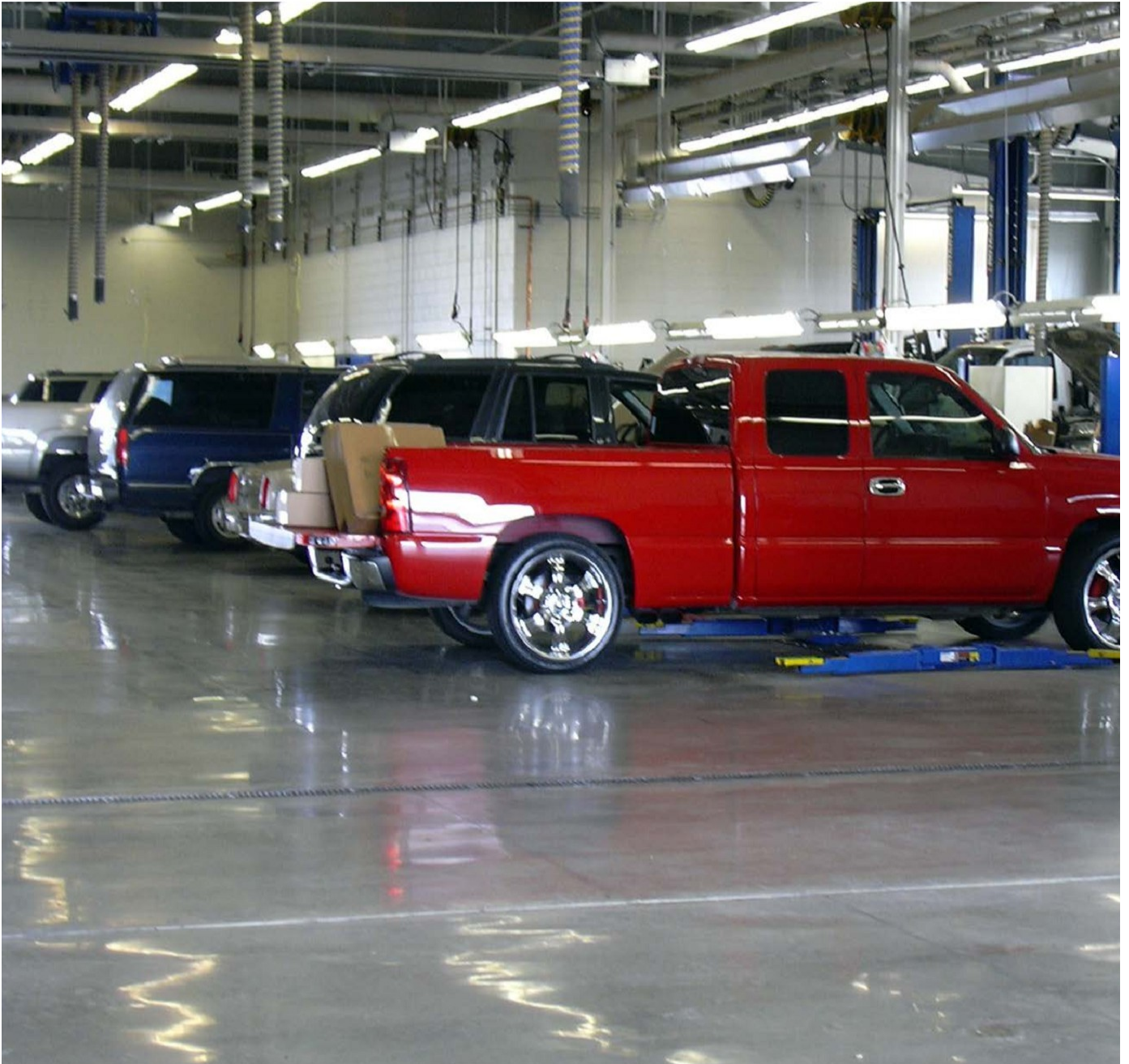
Level B, Cream, Natural Color, Auto Repair, 5 Years