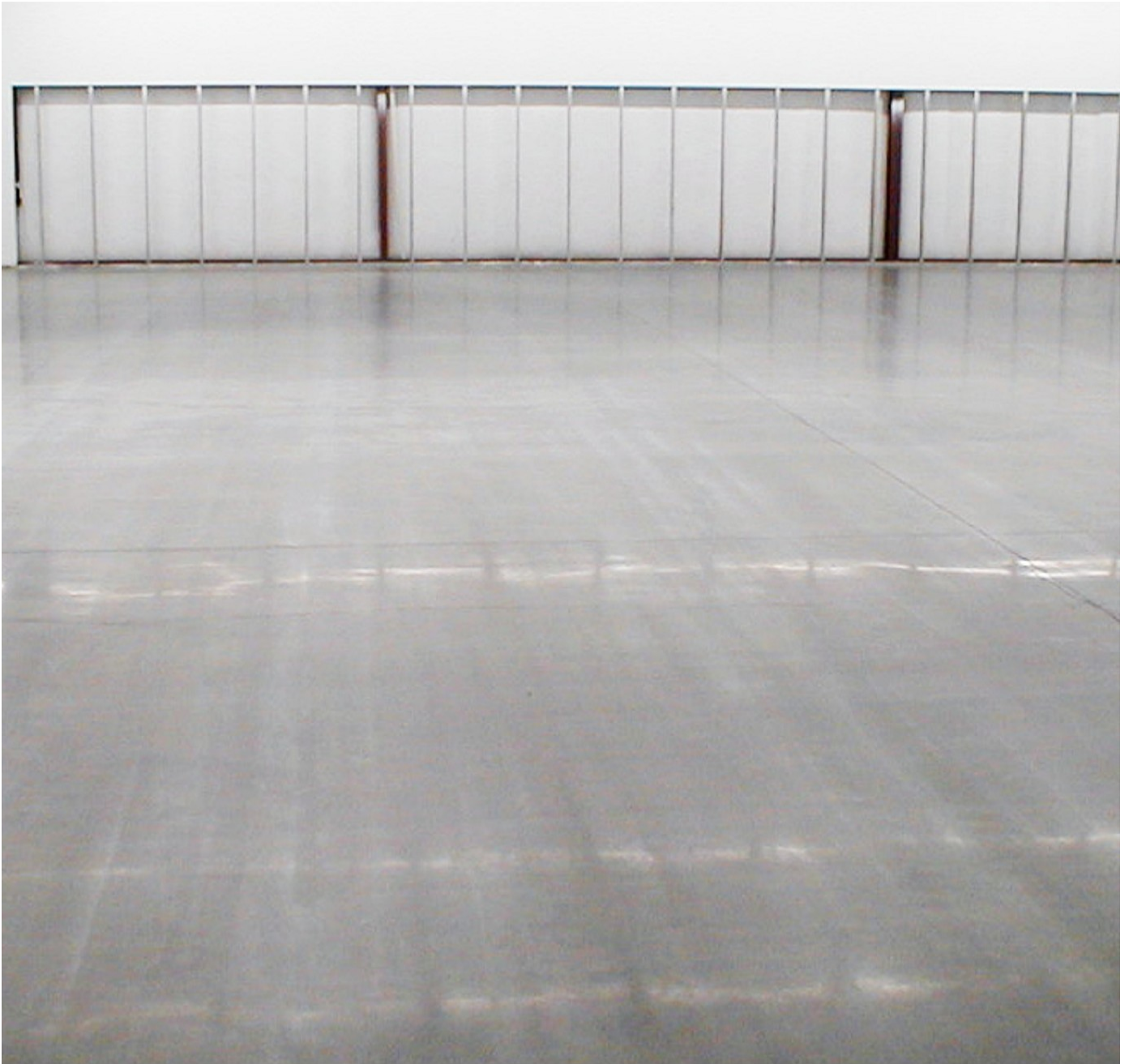
Level A, Cream, Natural, Retail, New